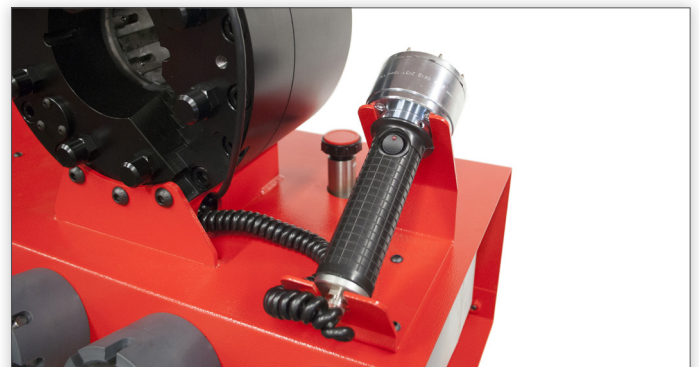
Integrated Quick Change system