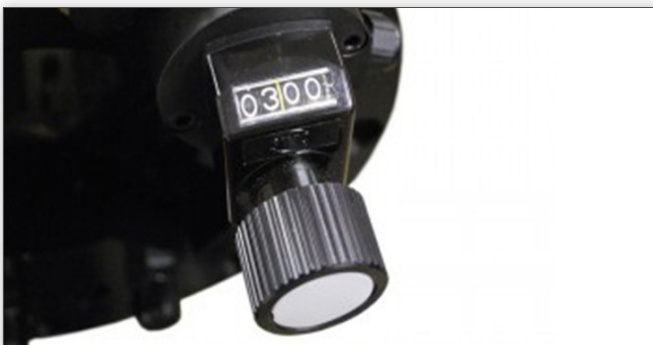
Simple dial adjusted calibrator