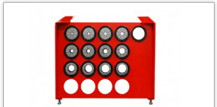
Option of quick change rack